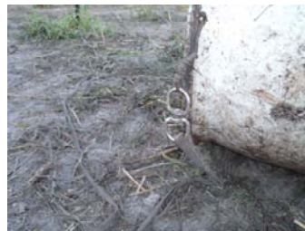
30 gal PVC barrel With swivel tied to center T Post

The opening at bottom of the trap is for loading out. While loading prevent hogs from going under the trailer with boards! You can also dig ruts out for your trailer wheels, to have your trailer floor sitting at ground level. Point the load out towards the pigs home. During load out they will want to escape the direction they usually escape and head home.